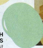
PITTSBURGH PAINTS Sprite Twist