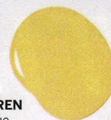
RALPH LAUREN Goldfinch