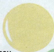
PITTSBURGH PAINTS Banana Pudding