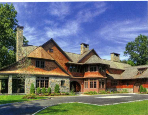
RIGHT: Gleysteen Design included gables, bays, and a stairway tower. ABOVE: Sweeping shingled walls and layered elements on a house by Mitchell Wilk Architecture. BELOW: Handsome period staircase in a new Shingle Style house that met Nantucket's strict historic district guidelines; by Nantucket Architecture Group. OPPOSITE: Designed by Albert, Righter, & Tittman, RockSyde sails toward the ocean.