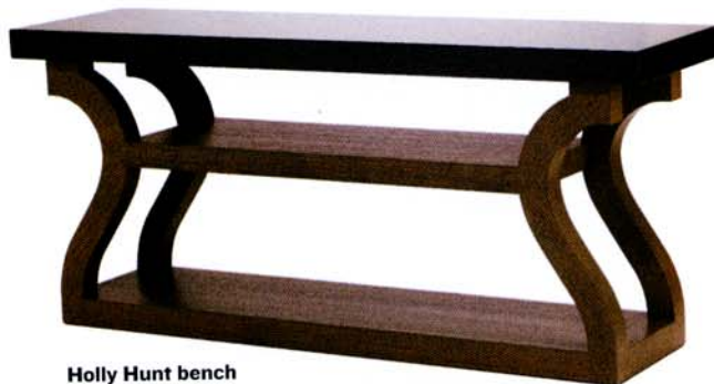
Holly Hunt bench from Webster & Company.

With almost 20 years' experience installing and refinishing top-quality wood floors, C & R is the favorite among the professionals on our panel. Its small showroom carries samples