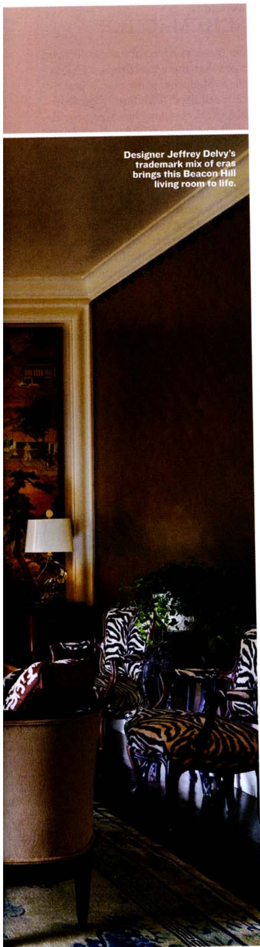
Designer Jeffrey Delvy's trademark mix of eras brings this Beacon Hill living room to life.

A bit contemporary, a bit traditional, completely timeless. That's the classic style, and one ideally suited to New England's historical bent. Yet the best classic designers don't simply shop showrooms; they're students of the decorative arts who use their knowledge of details and fabrics to nimbly combine various eras. The result: Décor that's richly textured, worldly, and absolutely up to date.